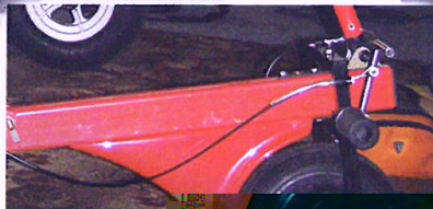
Nose wheel fairing