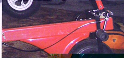
Nose wheel fairing